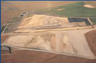
Landfill Aerial View